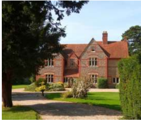
The Old Vicarage

The Old Vicarage is the home of the Phipps family who have kindly given us permission to park our cars on their drive.