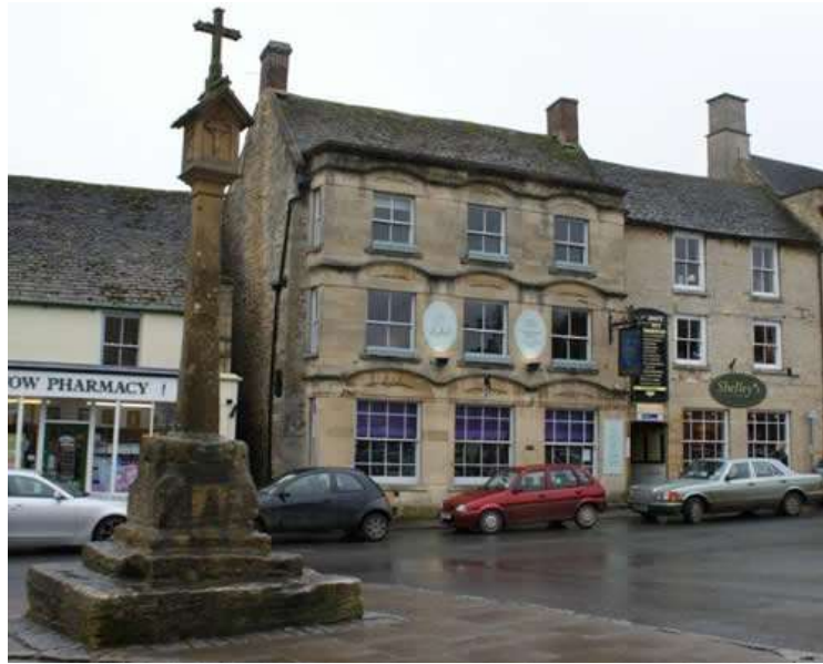
TALBOT Inn Stow on the Wold

Head south out of Stow towards Bourton on the Water on the A429 and after about a mile there is a left, off the main road onto the A424 which you take and the hotel is about a half mile on the right. Swimwear needed for the pool party.