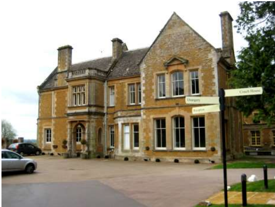
Wyck Hill Hotel, our overnight stay on Day 2

Wyck Hill Hotel, Satnav GL54 1HY. Tel: 01451 831936