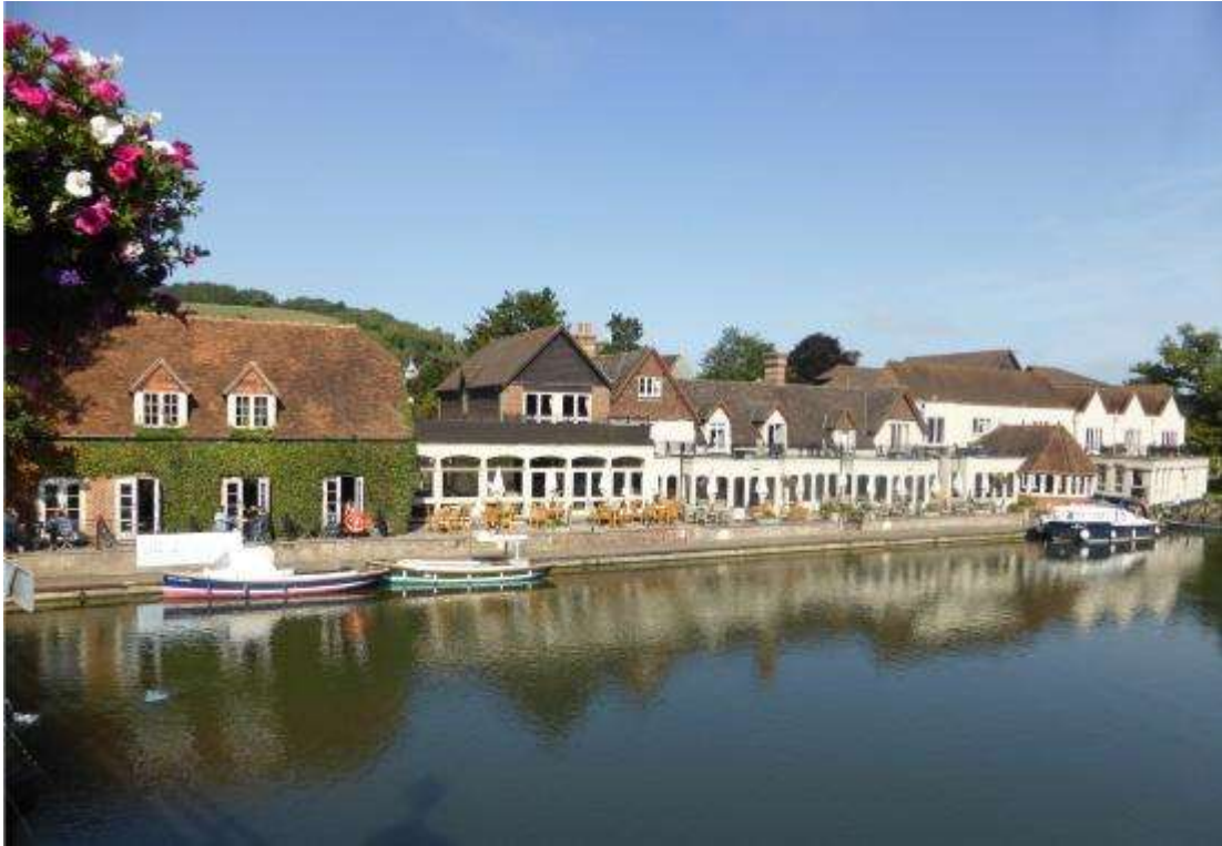
Swan Hotel at Streatley

finally Streatley. Once you get into Goring by going over the railway bridge keep going ahead and cross the Thames, the hotel is immediately on the right, unmissable.